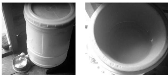
Figure 1. The outside and inside of a ceramic water purifier.

Because large scale public treatment systems may be decades away for much of rural Cambodia, POU treatment options have been widely promoted and are identified as an effective option in both cost and removal capabilities. The CWP is a viable option, as it is produced by NGOs in-country with locally